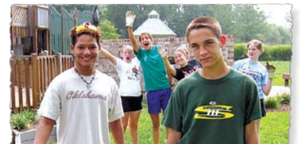
With grass-seeding work complete, TAC members plan to focus next on painting and installing an irrigation system at Evansville's Kids' Kingdom Park.