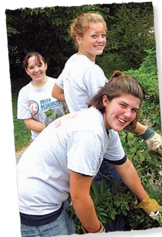
Teen Advisory Council (TAC) has adopted the Kids' Kingdom Park on Evansville's south side. Volunteer members landscaped and mulched the park.

Youth Resources of Southwestern Indiana is using a $2,326 grant from Vanderburgh Community Foundation to make a powerful impact in the community through its Teen Advisory Council (TAC).